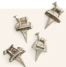
Vintage Cheese Markers etsy.com for similar