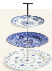
Transferware Tiered Stand from $150; food52.com

Finer finds for a French-infused pique-nique .