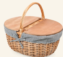
Striped Picnic Basket $47; amazon.com