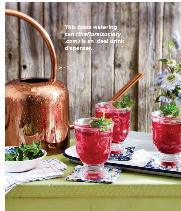
This brass watering can ( thefloralsociety.com ) is an ideal drink dispenser.

"Who doesn't like a dollop of decadence while picnicking?" asks Lela, referencing the salty caviar (she loves roecaviar.com ) atop steamed purple fingerling potatoes with blue cheese. Assorted cheeses with a sliced baguette, dried fruit, and mixed nuts round out the meal.